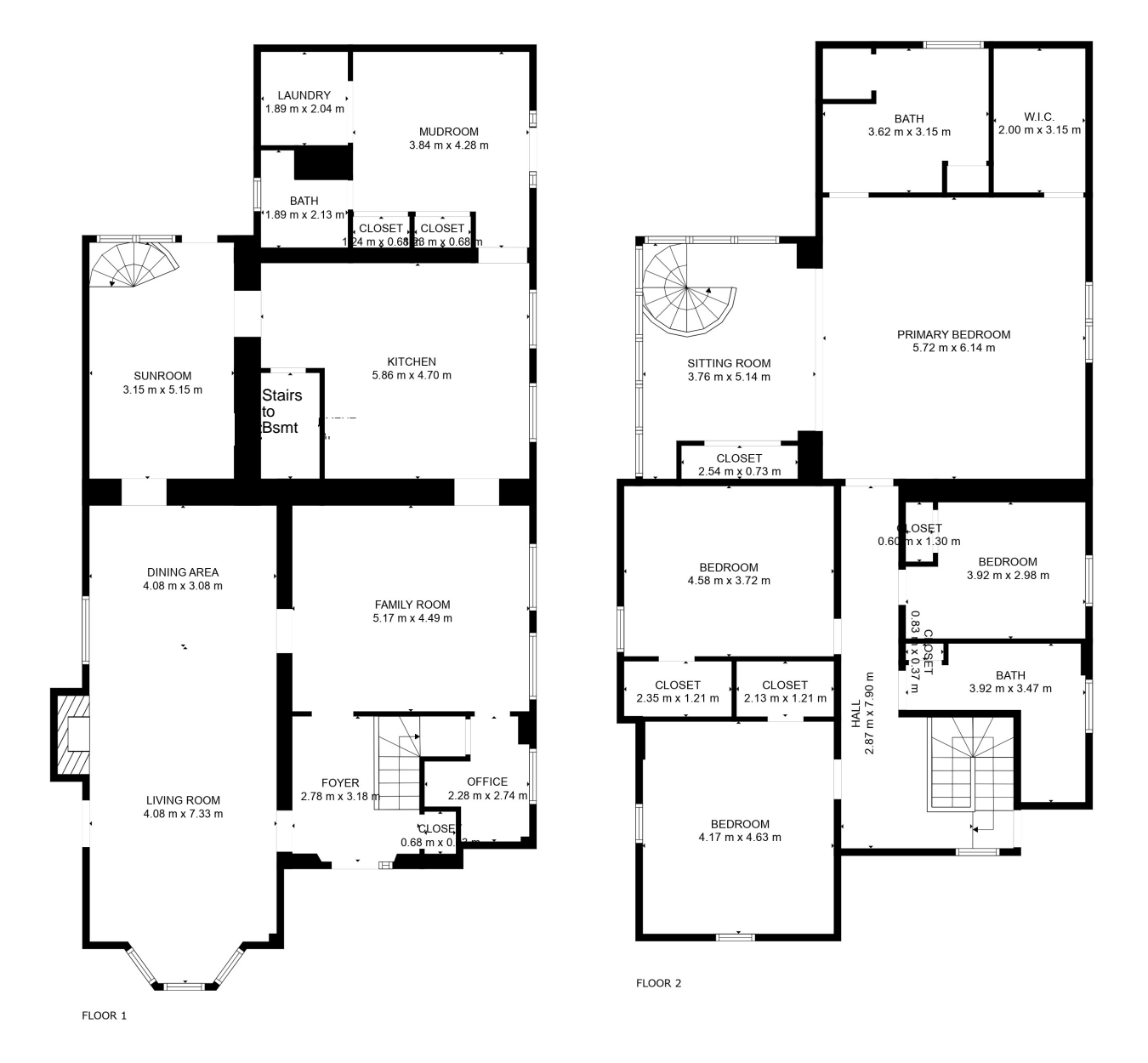
GROSS INTERNAL AREA FLOOR 1: 160 m2, FLOOR 2: 160 m2 EXCLUDED AREAS: , UNFINISHED BASEMENT: 3 m2 TOTAL: 320 m2